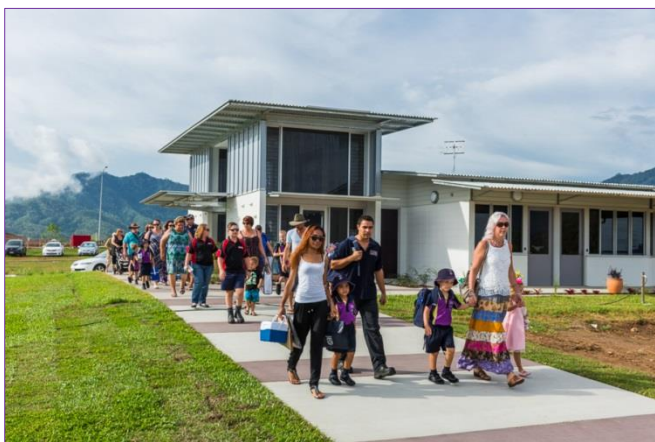
Arriving for the first day of school

Our families have been most understanding and accommodating about the surprisingly few hiccups we have experienced so far; thank you! We know there will be more to come, but our flexibility and focus on the bigger picture will see us through.